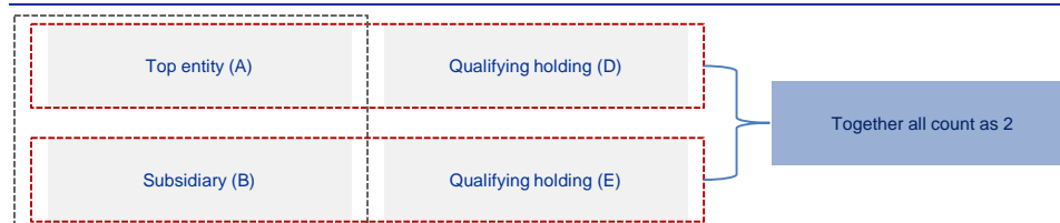
Figure 2 Counting of multiple directorships